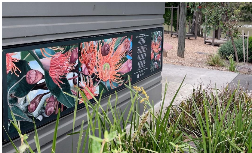
Image: Hsin Lin and Lauren Hancock, Blossoms of Life - The Eucalyptus Flower for Everyone , 2022