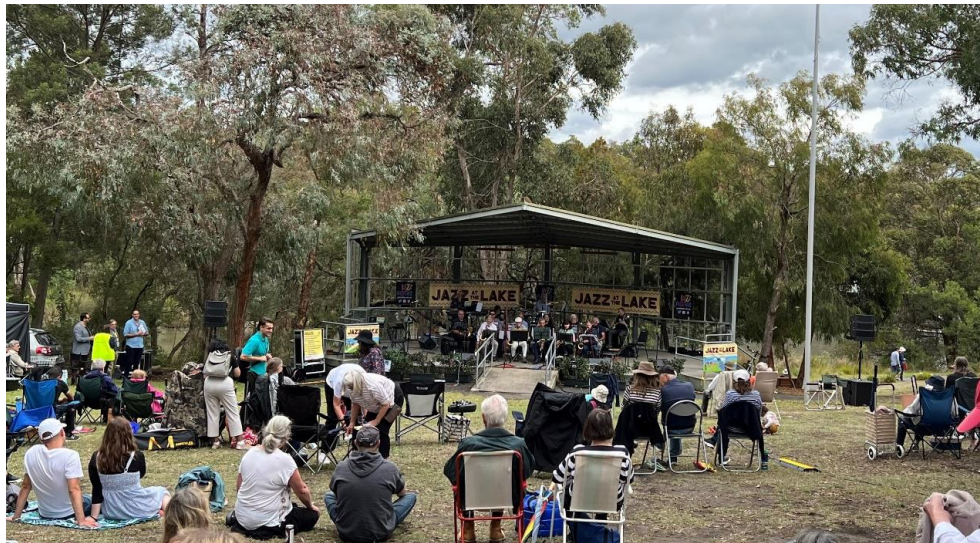
Image: Jazz Notes, Jazz at the Lake , Ringwood Lake Sound Shell, 2022