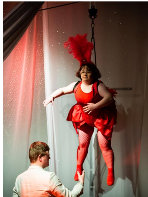
Image: YourDNA FUZE Ensemble's PORTAL, 2022.