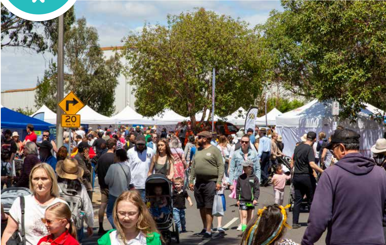
Maroondah Festival 2023