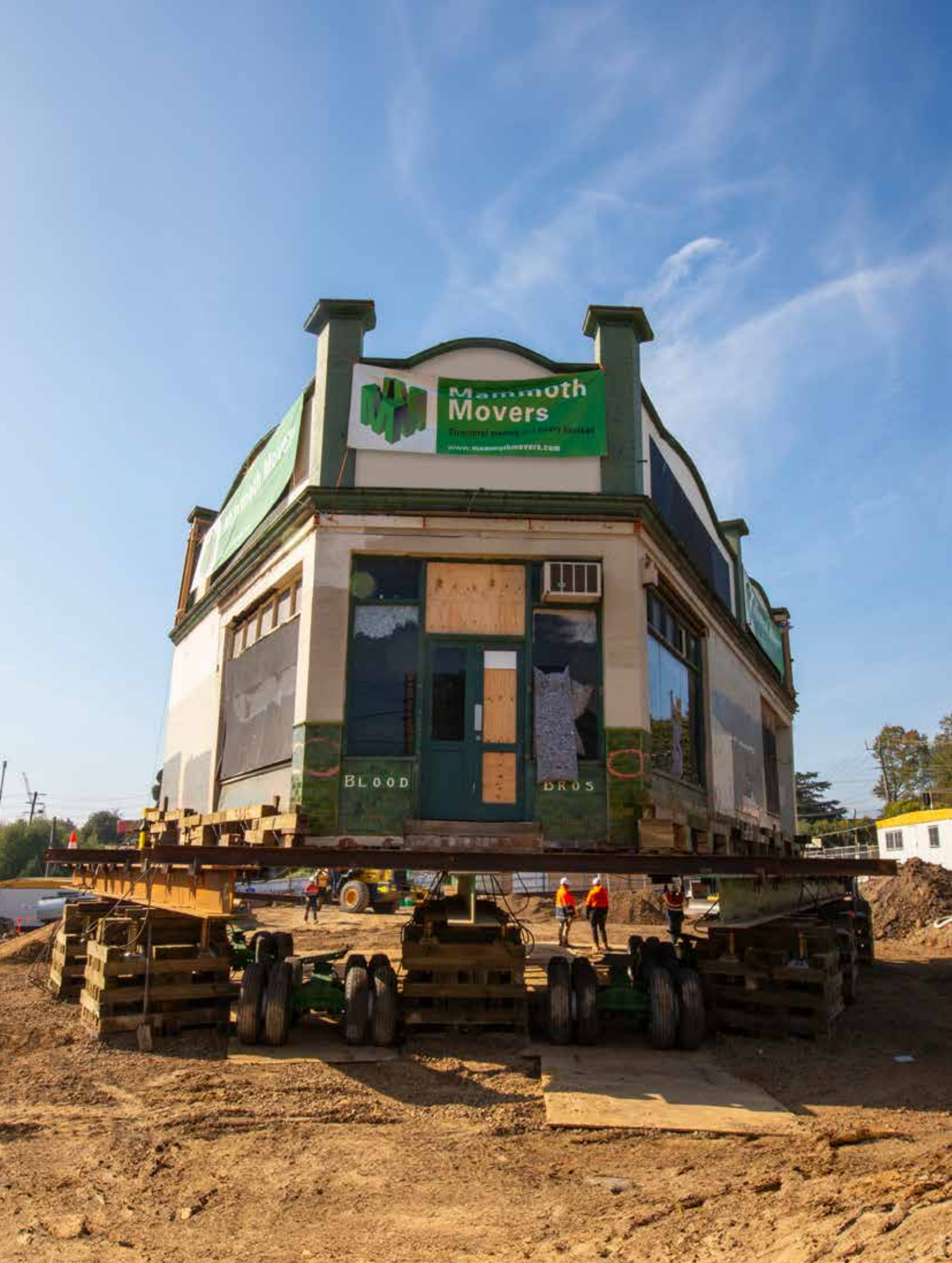
Construction in progress of the Ringwood Activity Centre carpark, May 2024