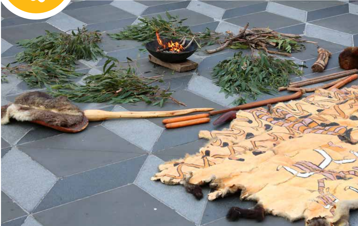
Reconciliation Week at Realm, Ringwood 2023