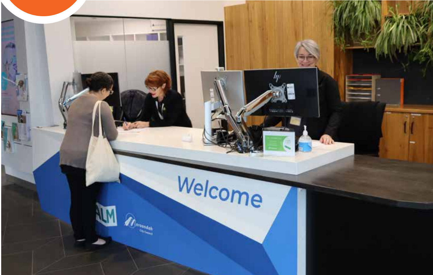
Customer service counter at Realm, Ringwood