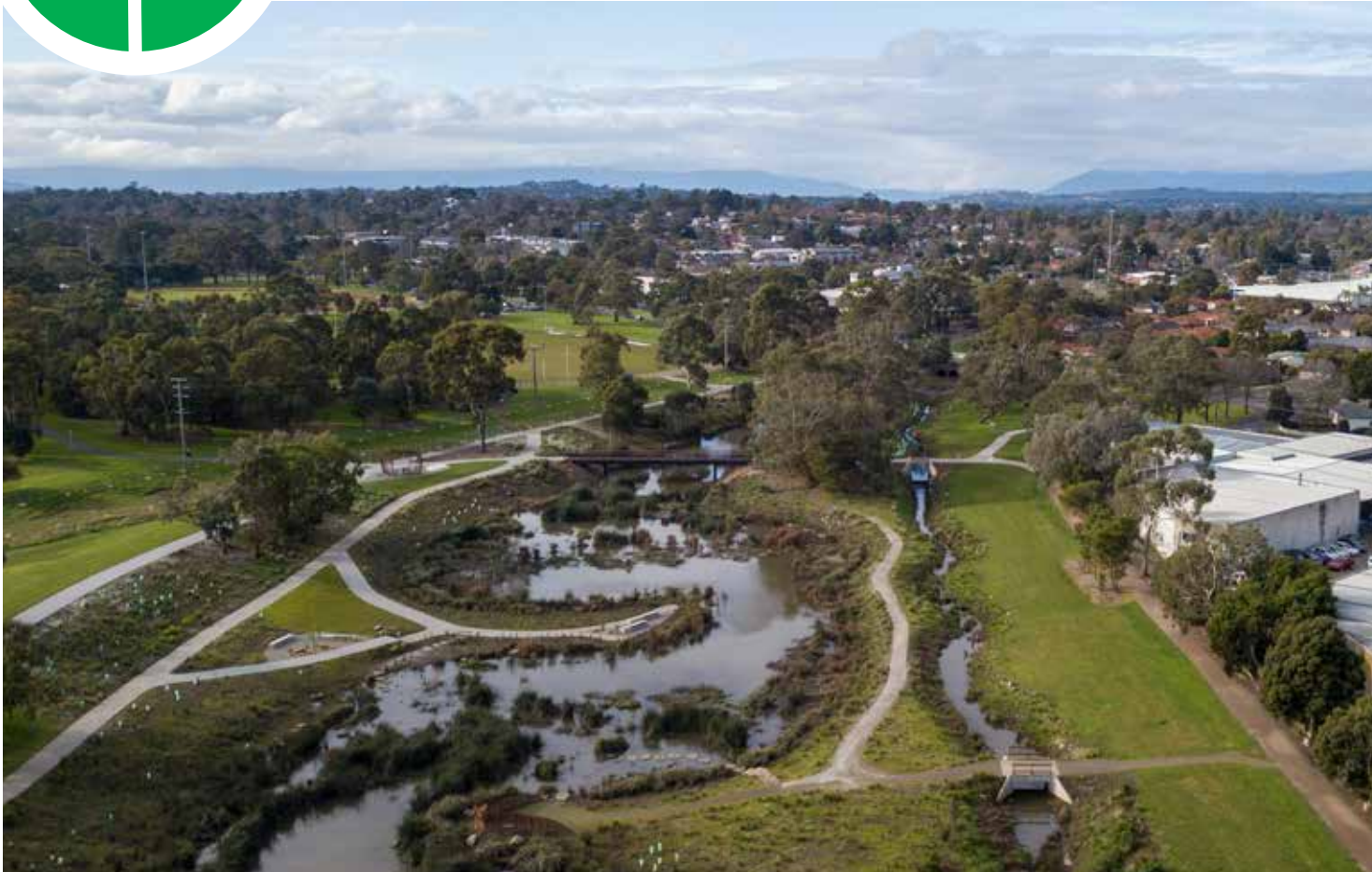
Reimaging Tarralla Creek Project, Croydon