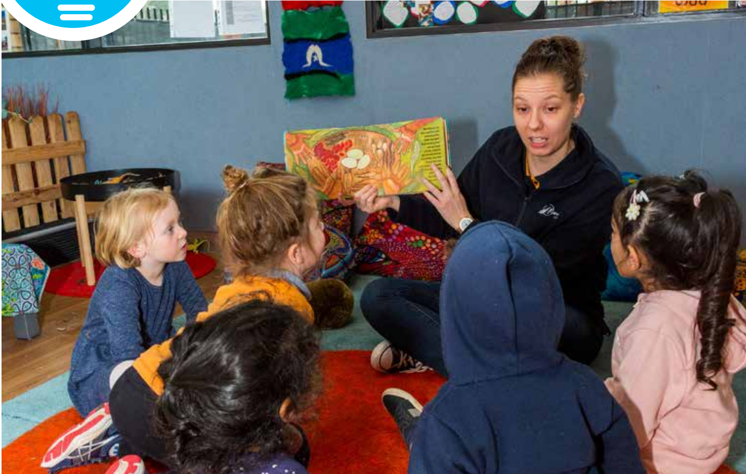
Maroondah Occasional Care, Croydon