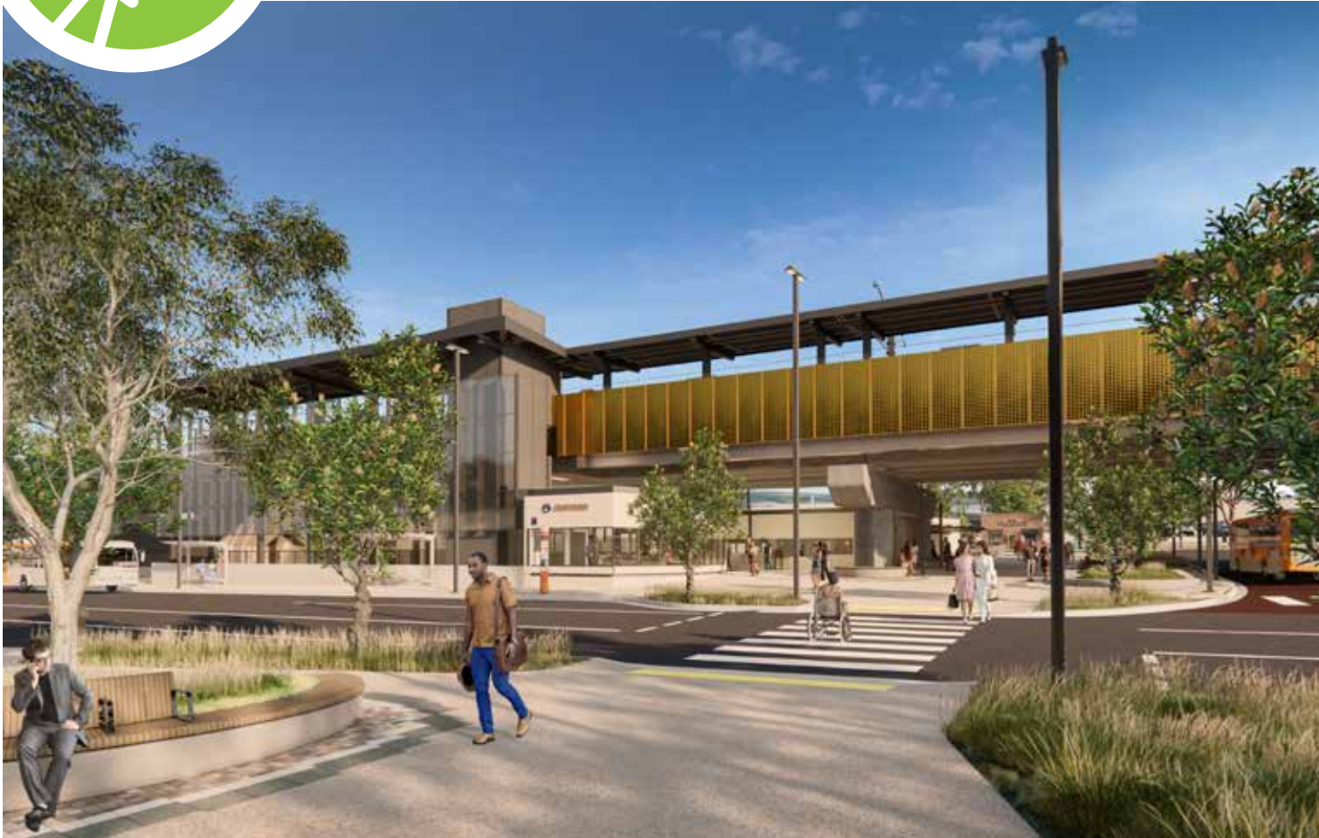
Croydon Station artist impression