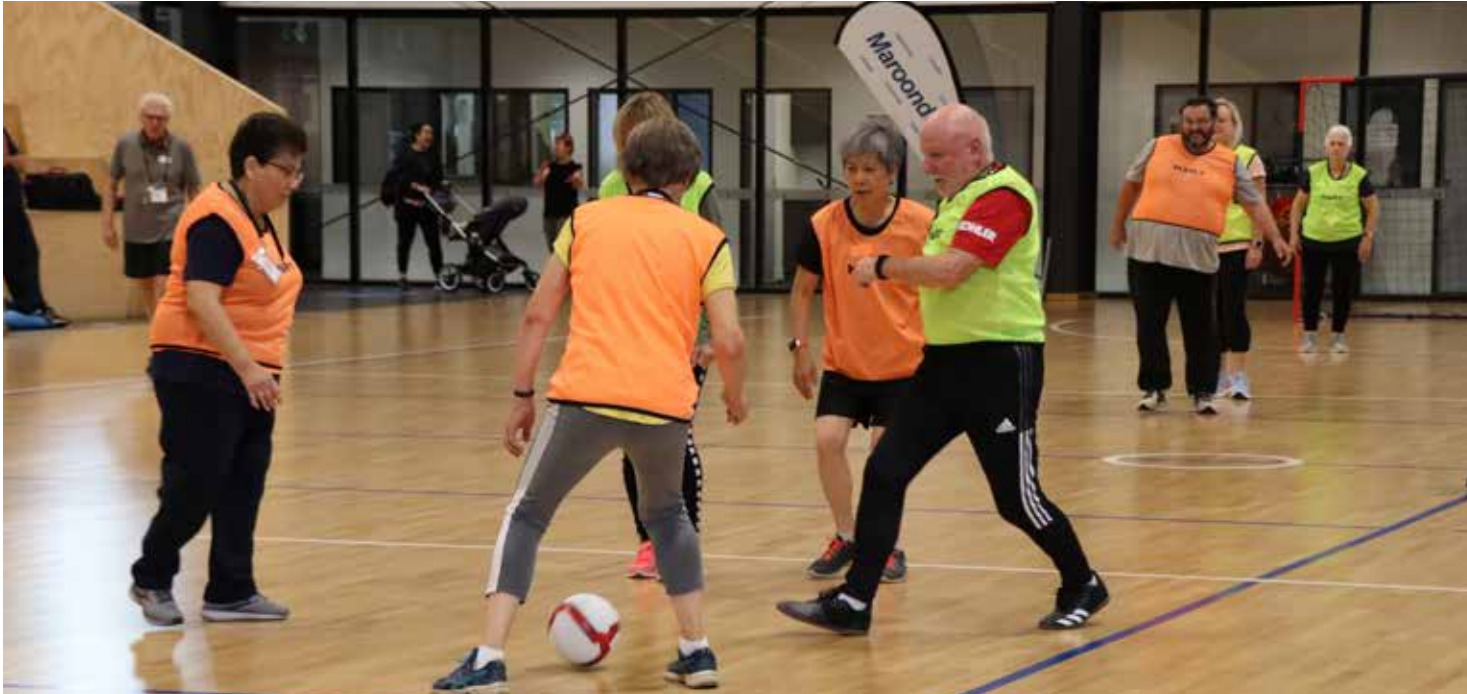
Walking Sports at Maroondah Nets, Ringwood