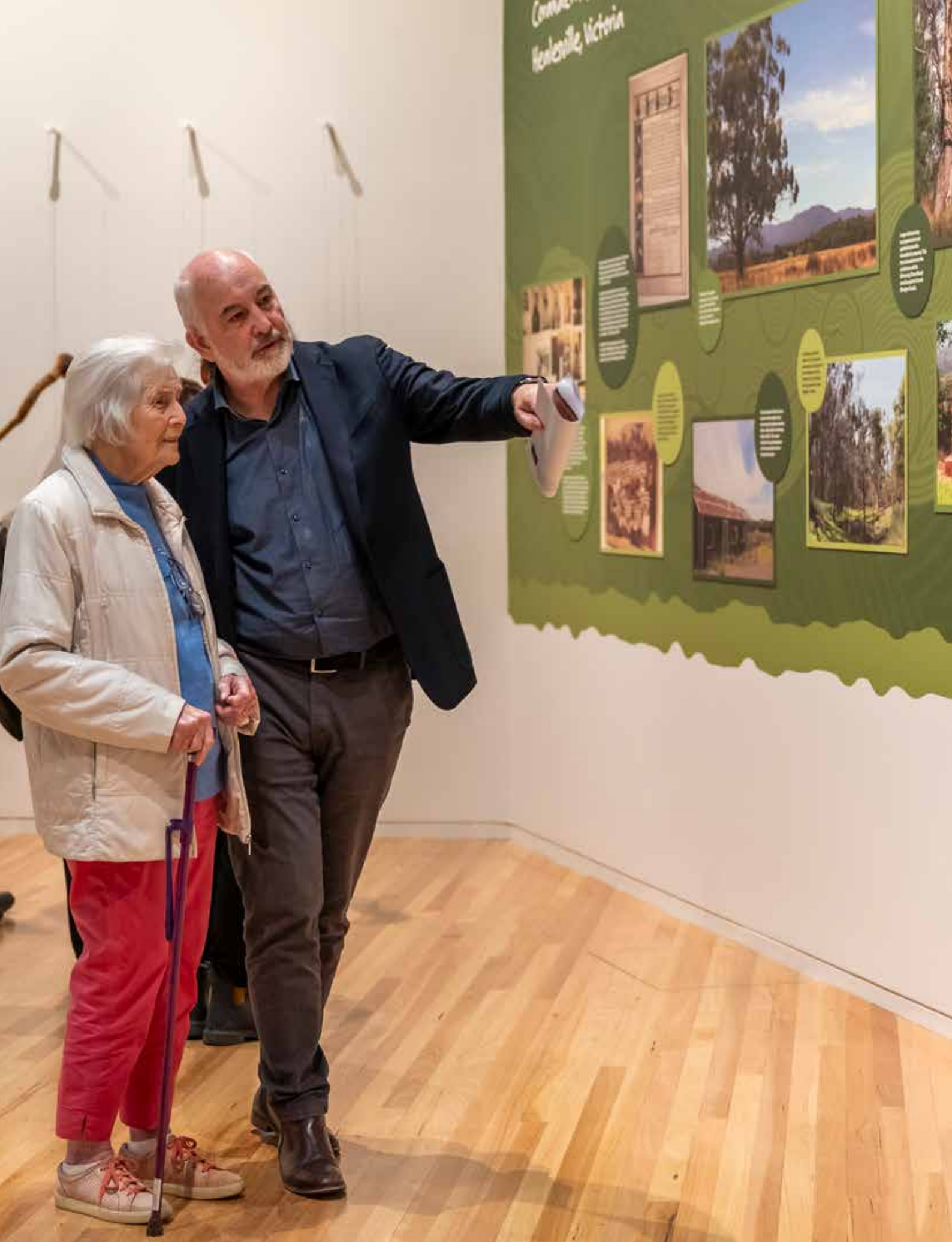
Grounding and Connecting exhibition, ArtSpace at Realm, April 2024.