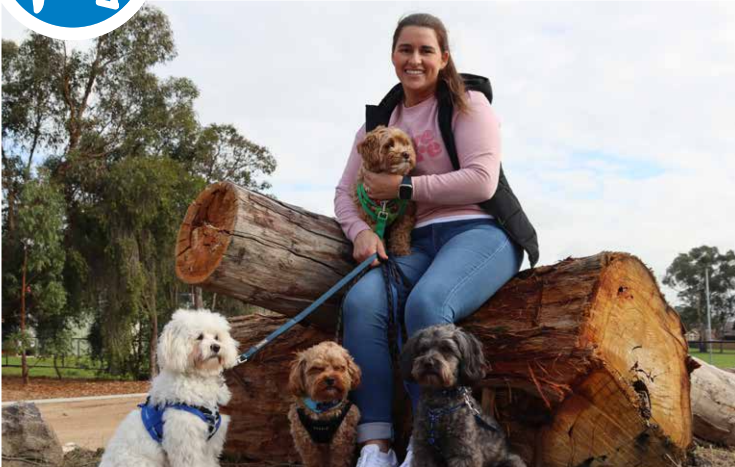
Visitors to the Parkwood Dog Park, Ringwood North