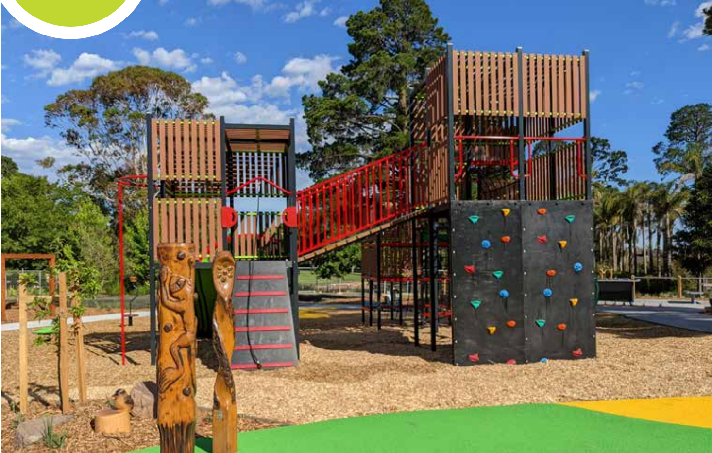
McAlpin Reserve, Ringwood North