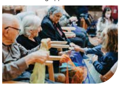
Council's 2023/24 Community Grants funding program helped to support Big Little Buddies' music-based intergenerational program.

search for 'smartysearch' to use the SmartySearch platform and find current funding opportunities.