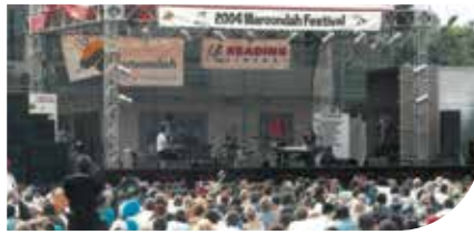
Crowds enjoying performances at Maroondah Festival 2004. This much-loved community event has been bringing people together since 1994.

Over the past three decades, Maroondah has become home to a richly diverse and vibrant community. From hosting 28 Maroondah Festivals