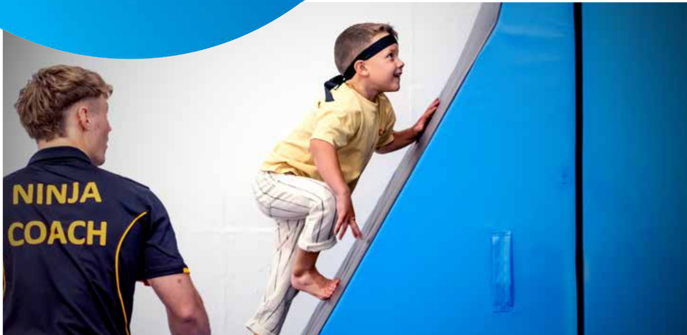
The Ninja program will see children scaling a vertical wall and climbing to new heights on a Ninja Frame.